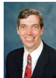
Senator Alan Cropsy

As expected, however, a group of trade associations filed suit to overturn the legislation on First