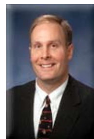
Rep. John Moolenaar