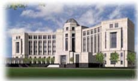
Michigan Hall of Justice